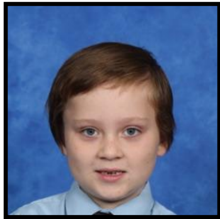
Lane – Week 7